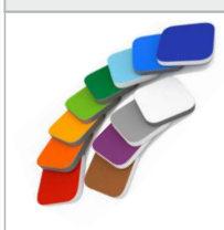
PLATE AND ROPE CONNECTORS MADE OF INJECTION MOLDED POLYAMIDE

PLATES OF THE WALLS MADE OF COLOURFUL TRIPLE LAYERED 15 MM HDPE POLYETHYLENE