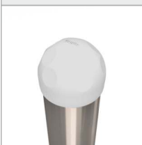
PLATE AND ROPE CONNECTORS MADE OF INJECTION MOLDED POLYAMIDE

SAFE PIPE PLUGS MADE OF INJECTION MOLDED POLYAMIDE