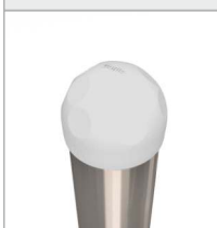
PLATE AND ROPE CONNECTORS MADE OF INJECTION MOLDED POLYAMIDE

SAFE PIPE PLUGS MADE OF INJECTION MOLDED POLYAMIDE