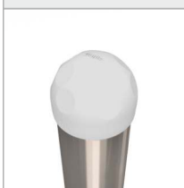
PLATE AND ROPE CONNECTORS MADE OF INJECTION MOLDED POLYAMIDE

SAFE PIPE PLUGS MADE OF INJECTION MOLDED POLYAMIDE