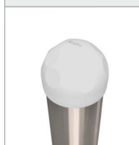
PLATE AND ROPE CONNECTORS MADE OF INJECTION MOLDED POLYAMIDE

SAFE PIPE PLUGS MADE OF INJECTION MOLDED POLYAMIDE